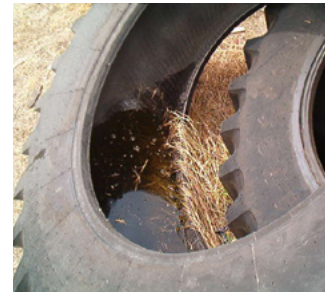
Tires collect water and are hard to drain, making them a perfect mosquito breeding place.