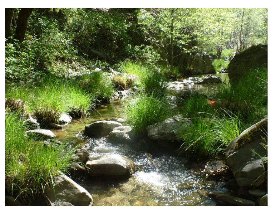
Storm drains flow directly to creeks and the Bay.

Be sure to remove covers or filters designed for temporary use after the activity is complete.