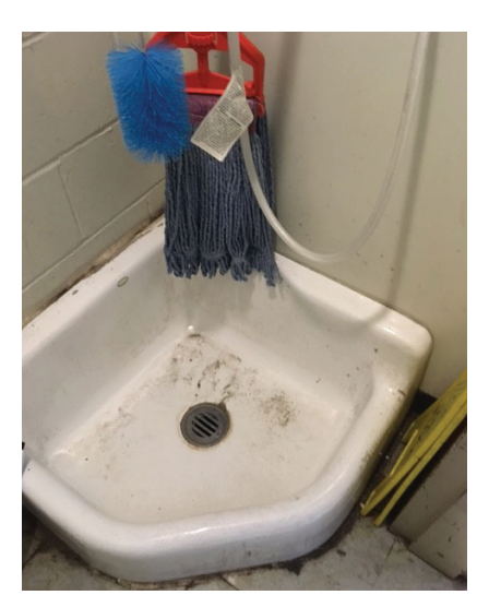
Sanitary sewer drain flows to treatment plant.