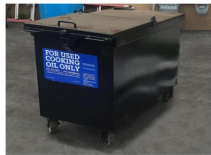
Keep used oil container clean.