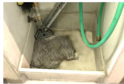
Empty mop water into mop sink.