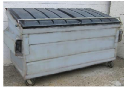
Keep dumpster lids closed.