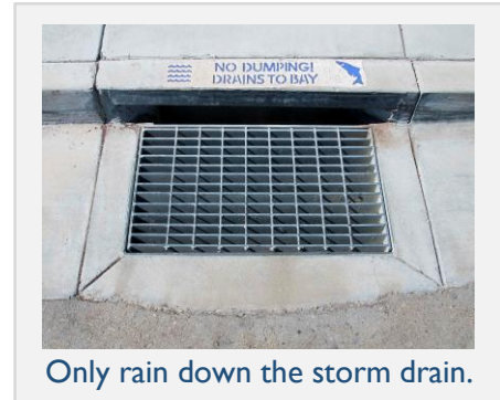
Only rain down the storm drain.

Never dispose of wash water or Fats, Oils and Grease (FOG) to storm drains.