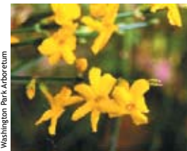
Washington Park Arboretum