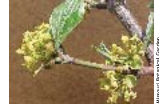
Missouri Botanical Garden

( Cornus mas ) A small tree that produces bright yellow flowers, which become bright red, edible berries that birds enjoy. Leaves may turn red and purple in fall.