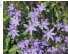
Missouri Botanical Garden

( Campanula poscharskyana ) Produces a profusion of lilac-blue, star-shaped flowers spring to fall. Grows quickly and easily, but could overwhelm a carefully manicured garden.