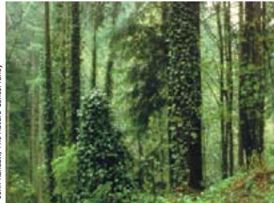
Invasive ivy covers forest understory vegetation

Some of these plants show weedy tendencies in the garden as well. For example, English ivy can take over a yard and damage buildings and fences. Likewise, when birds drop seeds near a stream, English ivy can take over native vegetation and degrade wildlife habitat.