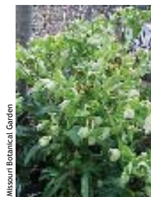
Missouri Botanical Garden