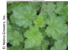
El Natio Growers, Inc.

( Heuchera maxima and hybrids) This evergreen groundcover has heart-shaped leaves and tiny, bell-shaped, pink and white flowers that hang gracefully from thin stalks.