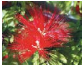
Ornamental Horticulture Research and Information Center, UC Davis