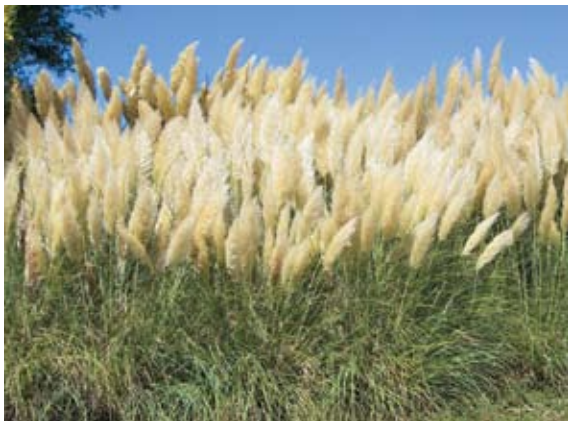
A dense stand of pampasgrass ( Cortaderia selloana ), a garden plant that has invaded California wildlands