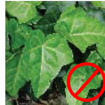
Missouri Botanical Garden

When birds carry the seeds of these popular plants into wildlands, ivies can smother trees and understory plants by completely shading them, which also prevents regeneration of new tree and shrub seedlings. Ivy can harbor pests, such as rats and snails. Researchers hope to determine which ivies can be used safely.