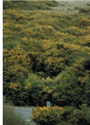
French broom invades Bay Area hillsides