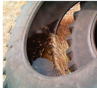
Tires collect water and are hard to drain, making them a perfect mosquito breeding place.